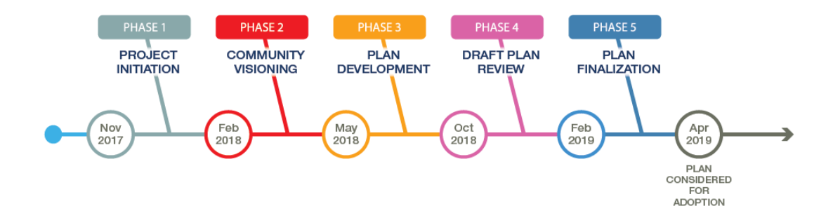
Figure 4: Project Timeline

The local area plan update is anticipated to take 18 months. Figure 4 provides an overview of the process, while Table 1 outlines the planning process showing project phases, key activities and deliverables. While project activities are fairly well defined, there exists some ability to adapt public engagement activities based on the feedback of the Project Advisory Committee and other community stakeholders, provided it meets overall project timelines and objectives.