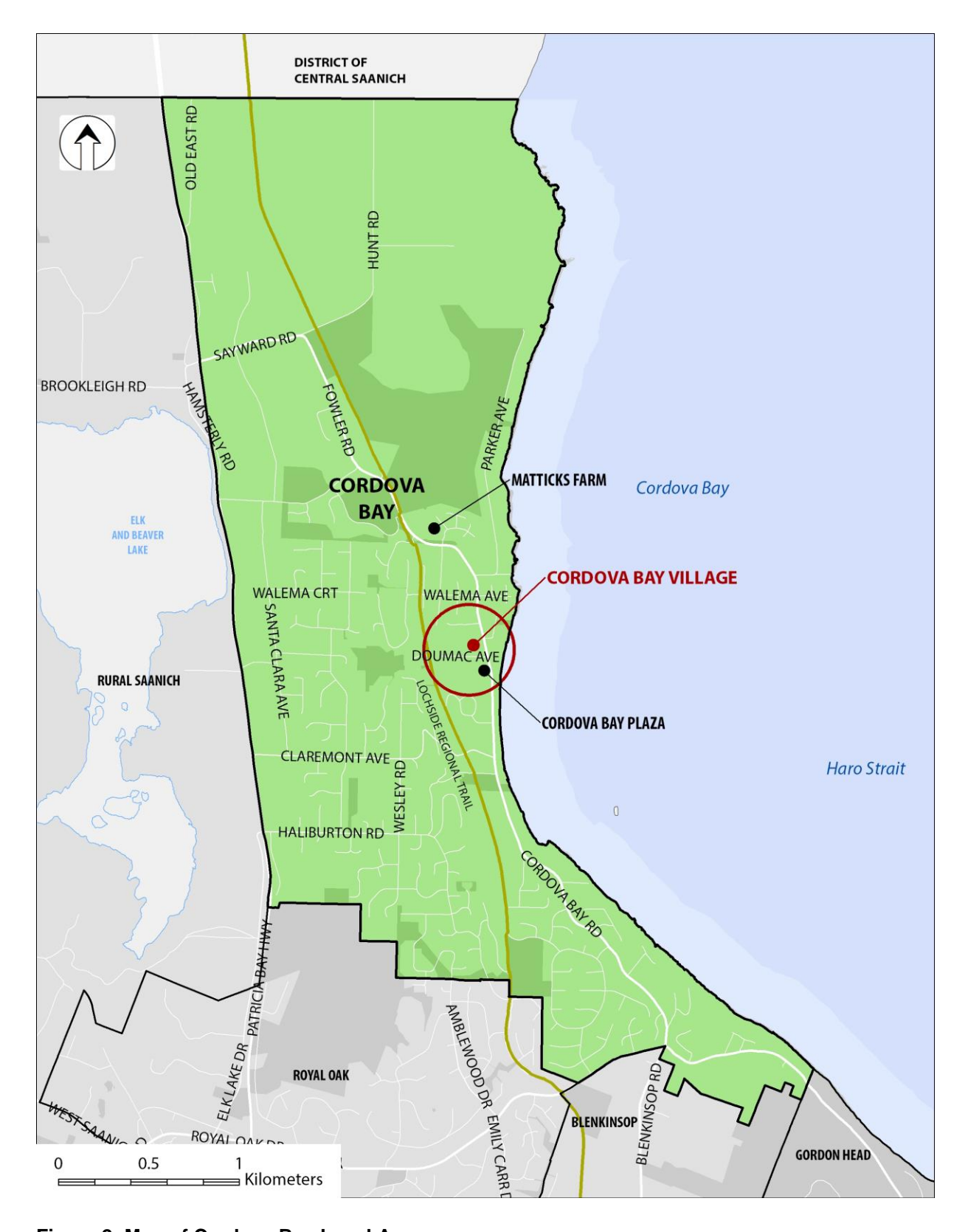
Figure 2: Map of Cordova Bay Local Area